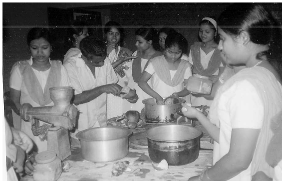
National Technology Day