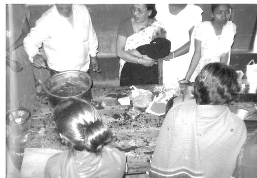
Entrepreneurs Development Programme