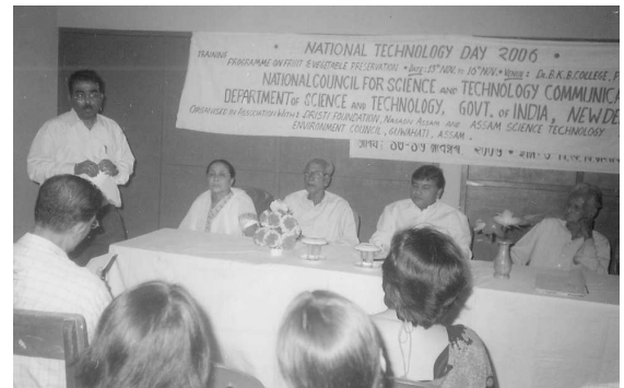
National Technology Day

Under National Technology Day -2006 .a training programme on Fruit & Vegetable preservation was organised amongst the college students of Dr. B.K.B. College, Puranigudam. The programme was organised under the banner of National Council for Science & Technology Development from 13th Nov, to 16th Nov. 2006.